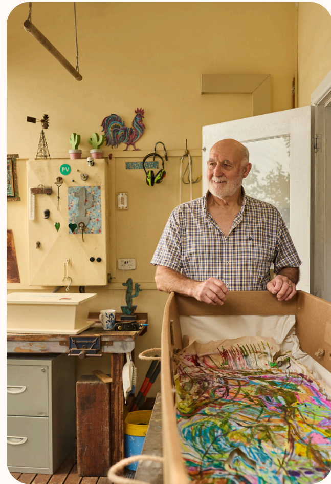
Download social media templates

We've got plenty of resources to help you start spreading the word about your Dying to Know event!