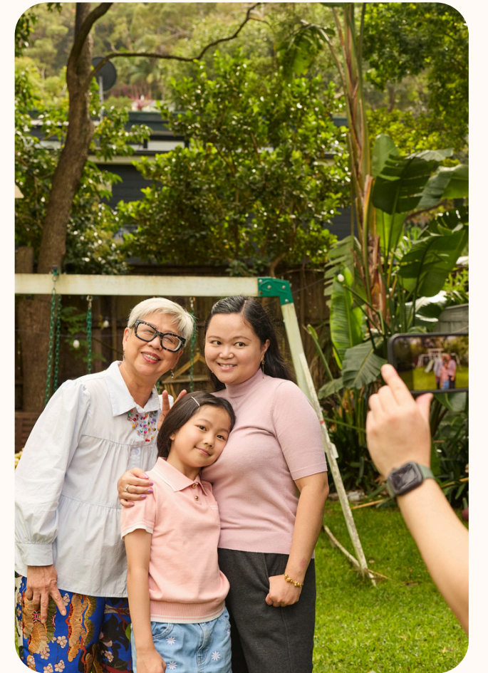
Visit website for more resources