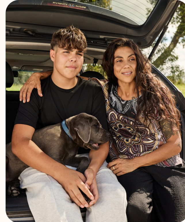
Add event to our website